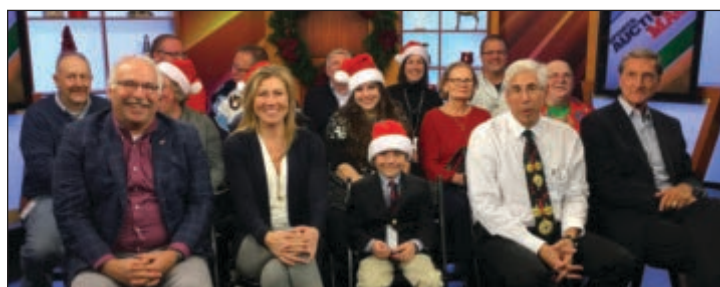
The live audience of doctors, patients, parents, researchers, sponsors and friends.