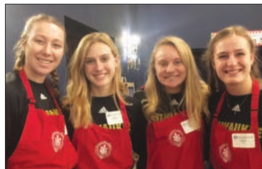
Members of the UIW Milwaukee Panthers Volleyball team.