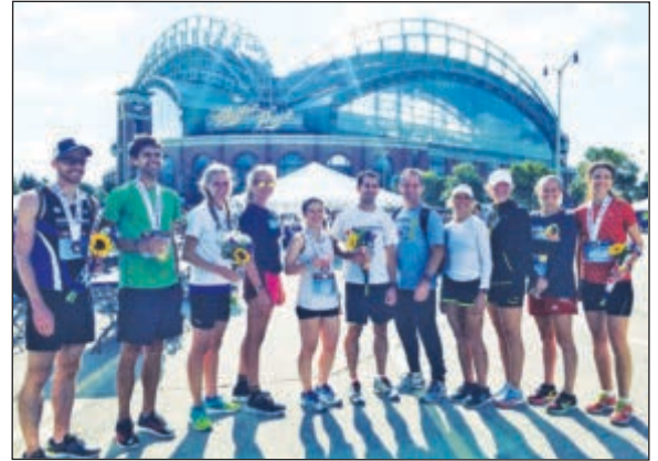
Some of the Mini + 5K and 10K winners with a great backdrop.

The 7th annual Brewers Mini-Marathon Presented by PNC Bank on Sept. 22, will once again begin at beautiful Miller Park. The events provide runners with scenic routes through Milwaukee along with prizes and a post-race tailgate party making this one of the most unique half marathons in the area. In addition, the races also offer an opportunity to raise money for the MACC Fund, benefitting childhood cancer and blood disorder research in Wisconsin. Thanks to many dedicated runners and their generous friends, the six editions of the “Brewers Mini-Marathon” raised nearly $270,000 giving another example of this Big League support.