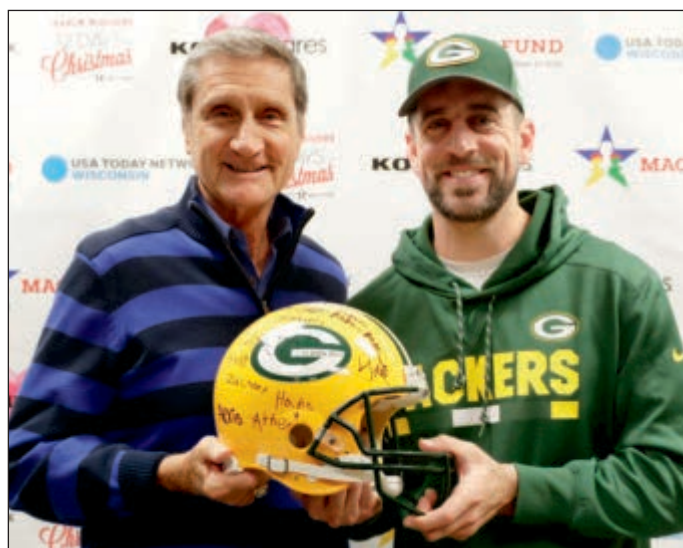
Jon McGlocklin presents Aaron Rodgers with a helmet autographed for him by the 12 kids from his "12 Days of Christmas" program.