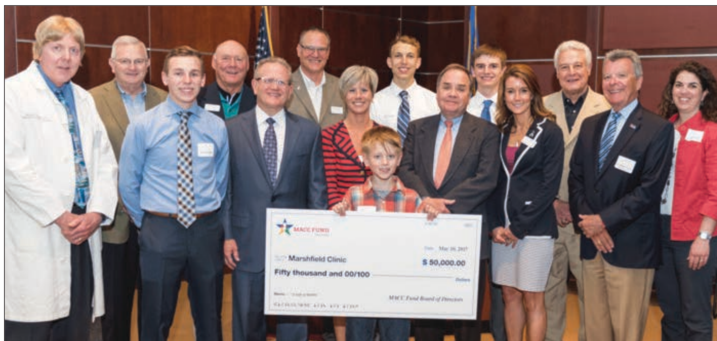
A grateful patient proudly holds the MACC Fund's research grant check in 2017.