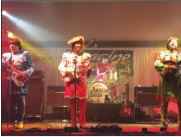
American English in the "Yellow Submarine" genre.